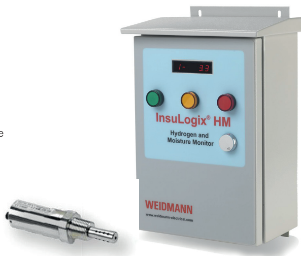
Optional moisture-in-oil sensor package